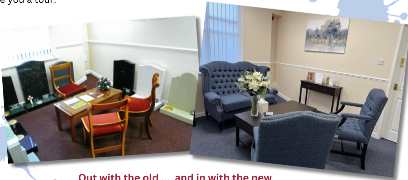
Out with the old .... and in with the new