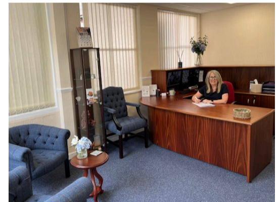
Newly refurbished High Street interior