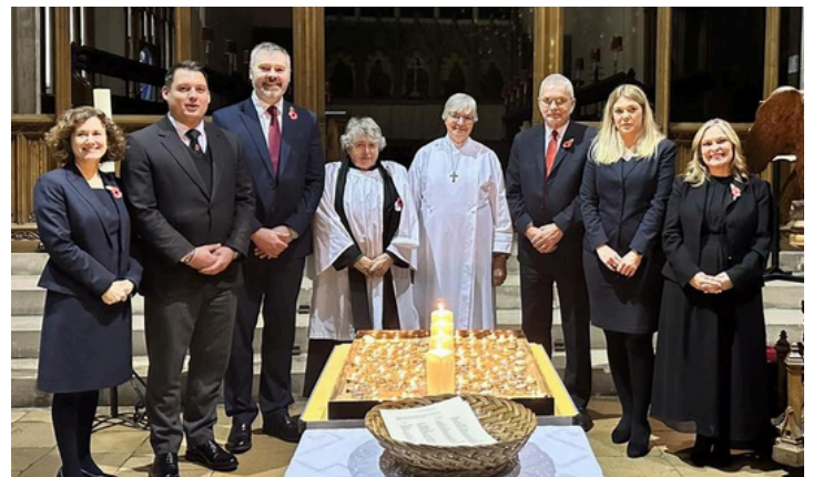
Our Saffron Walden team at the All Souls Service, St Mary's, Saffron Walden